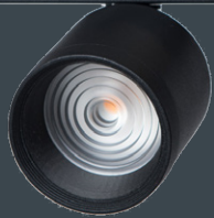
GA-016 Standard Molly